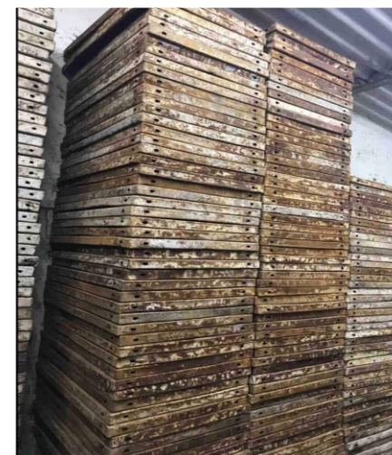
Metal sheet Cantering sheets

Apart from our own construction tools we have strong Associate network to under take large & complex jobs. We have logistic support back up to mobilise materials to any remote sites.