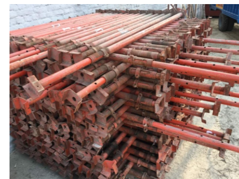
Staging and Scaffolding Cuplock Services, Construction 'H' frame Scaffolding & Joint Spigot Pins.